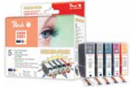
Inkjet Cartridges (Laser Toner coming soon)

Check out our web site to find the cartridges suitable for your printer and save 50% and more versus originals !