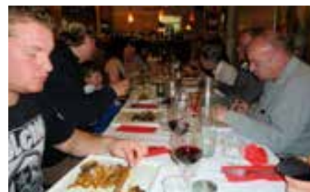
Fathers Day gathering supported by Swiss Club at Trattoria Il Segreto