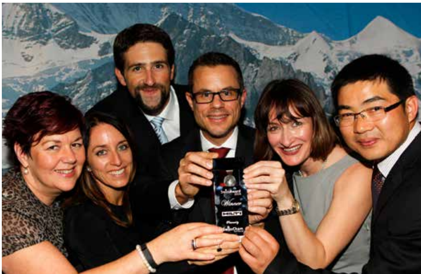
SwissCham's annual Swiss Award dinner: this year's winner was Hilti Australia.