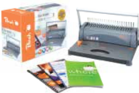
Binding Systems (Plastic and Wire)