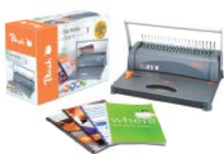
Binding Systems (Plastic and Wire)