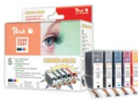
Inkjet Cartridges (Laser Toner coming soon)

Check out our web site to find the cartridges suitable for your printer and save 50% and more versus originals !