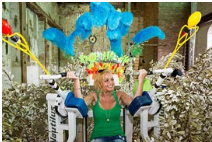
Gerda Steiner & Jorg Lenzlinger, Bush Power, 2014, mixed-media installation dimensions variable. Installation view of the 19th Biennale of Sydney (2014) at Cockatoo Island. The artists would like to thank the crew who assisted with the installation of their work. Created for the 19th Biennale of Sydney.